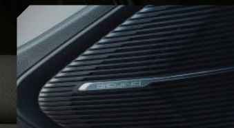
High Quality Speaker System